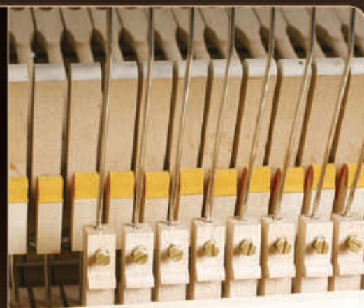
Deer Antler Hammers

With a touch that matches Yamaha concert grand pianos, hammers made of deer antler for a restrained reverberation, and the first ever single-layer action to create a uniform feel, the new key glockenspiel from Yamaha gives professionals ample reason to depend on Yamaha. Learn about these new models, features and more at 4wrd.it/CELLMU