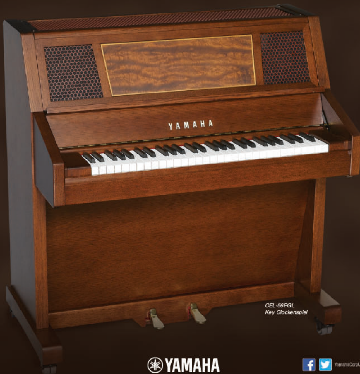
CEL-56PGL Key Glockenspiel